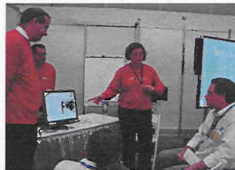
ON_DEC teachers conducting a workshop at NYC's annual Celebration of Teaching and Learning conference.

Through professional development and training materials for school leaders, teachers, students and parents; along with support for technology implementation, data management tools, communication and other materials we will help schools transform into 21 st century learning environments.